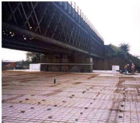
Fillmaster being used to support/underpin the Irlam Railway Bridge

2016. As far as is known this will be the first time that this material has been used in a civil engineering project on the Llangollen Railway, but it won't be the first time that our members and customers will have travelled over it. It is to be found supporting bridge abutments and embankments both on the motorway and national railway networks as well as pathways and roadways in our town centres.