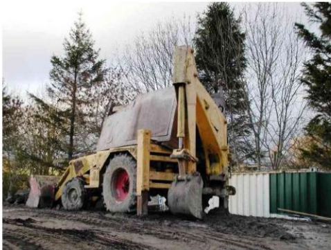
Newly acquired but elderly JCB 3c Excavator - still A Really Useful (Engine)... piece of kit for drainage and foundation digging duties