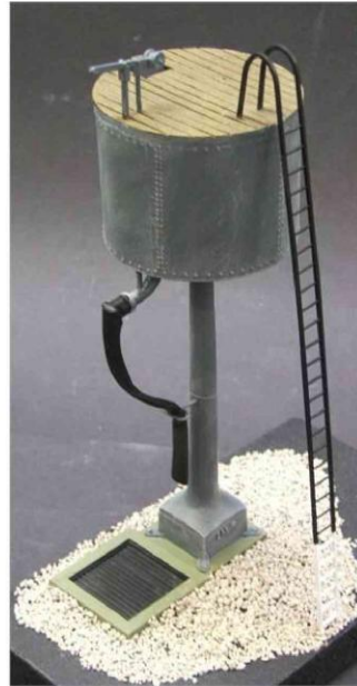
Model of LNWR Parachute Water Tank

A number of the building stages to get from Carrog to Corwen (East) have been funded via specialised appeals – the Sleeper and Ballast Funds for example. Although these are still open for contributions it is also time to think of the fixtures and fittings that will allow Corwen Central to become the operational focus as the western terminus of the Llangollen Railway.