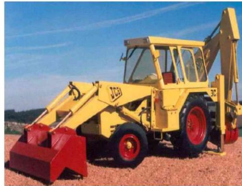
With a bit of the usual TLC from the Project Team - it could become like this again..... and continue to be very useful!!!

By the way JCB (Joseph Cyril Bamford) is also celebrating 70 years as a company. However, its first hydraulically tipped two wheeled trailer body didn't launch until 1948 ..... but as they say .....the rest can only be wondered at!!